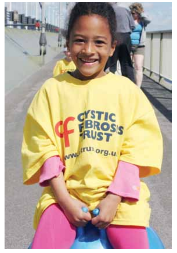
Big Bounce remains one of our most popular fundraising campaigns