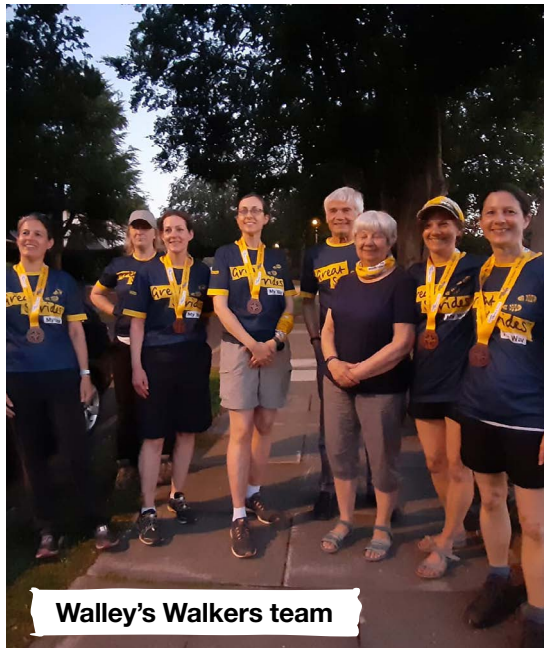
Walley's Walkers team

could pay for a day's worth of equipment at one of our Strategic Research Centres, helping to create ground-breaking discoveries in CF research.