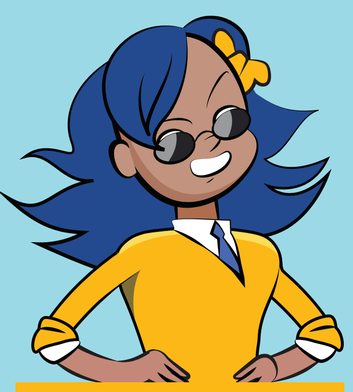
Take a look at five treatments used by people with CF today, thanks to clinical trials: bit.ly/35mvoQv